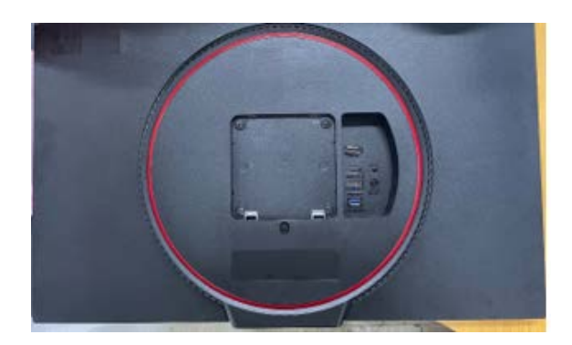
Re-overturn the set and disaaemble screw 4EA and disassemble the PCB