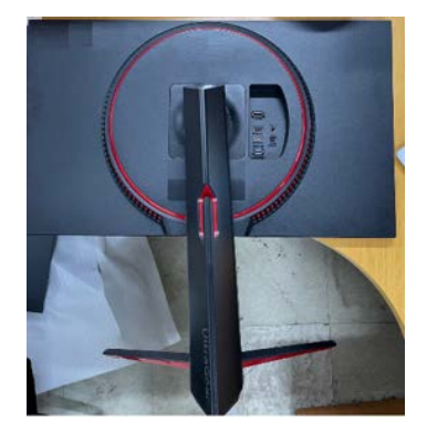
Push button and lift the stand